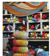
Fuzzy Goat shop