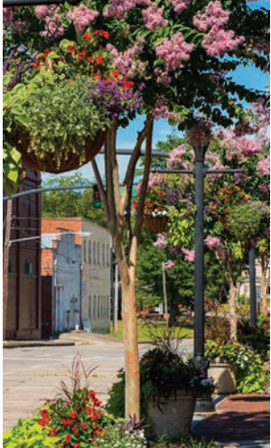
City of Jackson