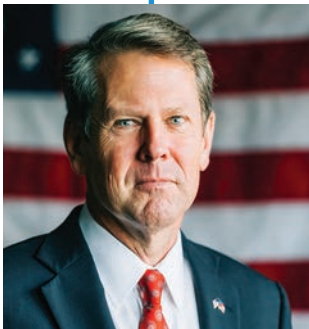
Governor Brian P. Kemp