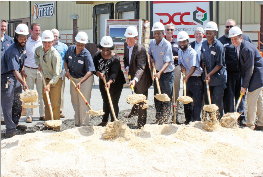
Ben Hill County stakeholders break ground on the new Mana facility.