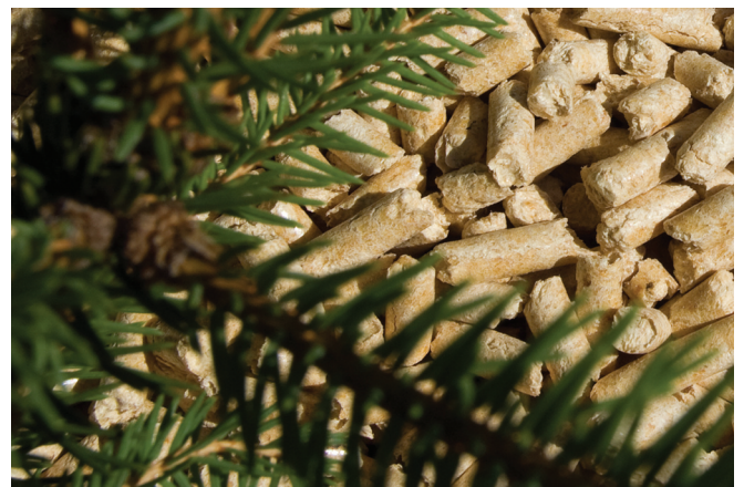
Wood pellets are used for fuel largely in the European Union.

Mill processing - When trees come in for cutting they are optically scanned and measured with lasers to provide the cutting equipment data on the optimal cuts, maximizing the quantity of wood product from each piece of timber.