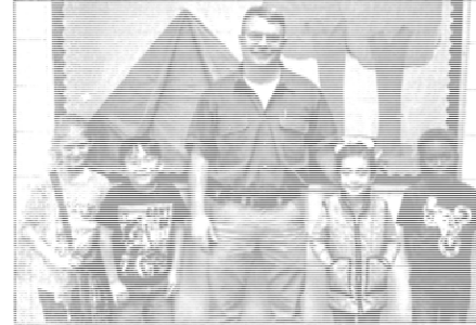
Children recognized for achievements

5-A - The Herald-Leader • Fitzgerald, Ben Hill County, Georgia • Wednesday, February 15, 2017