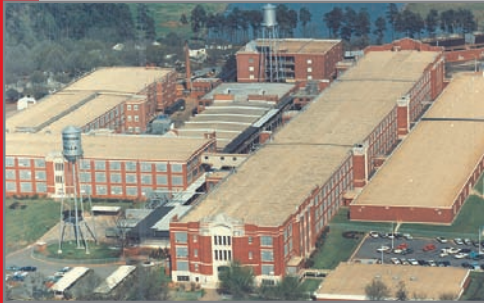
B.F. Goodrich Building - Thomaston, Upson County