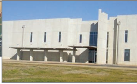
Thomaston, Upson County speculative building