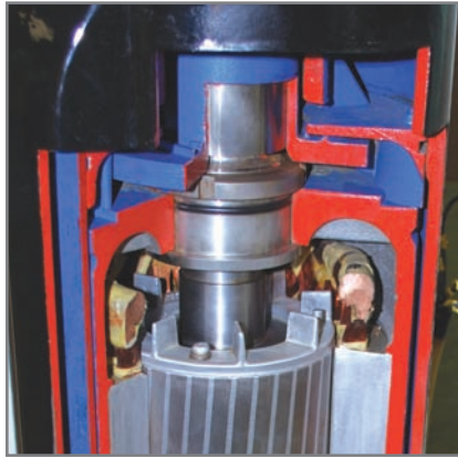
A cutaway of a Wilo pump